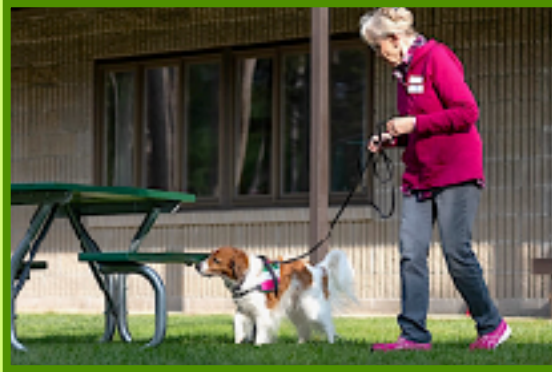
Can you see that he found my cotton ball?